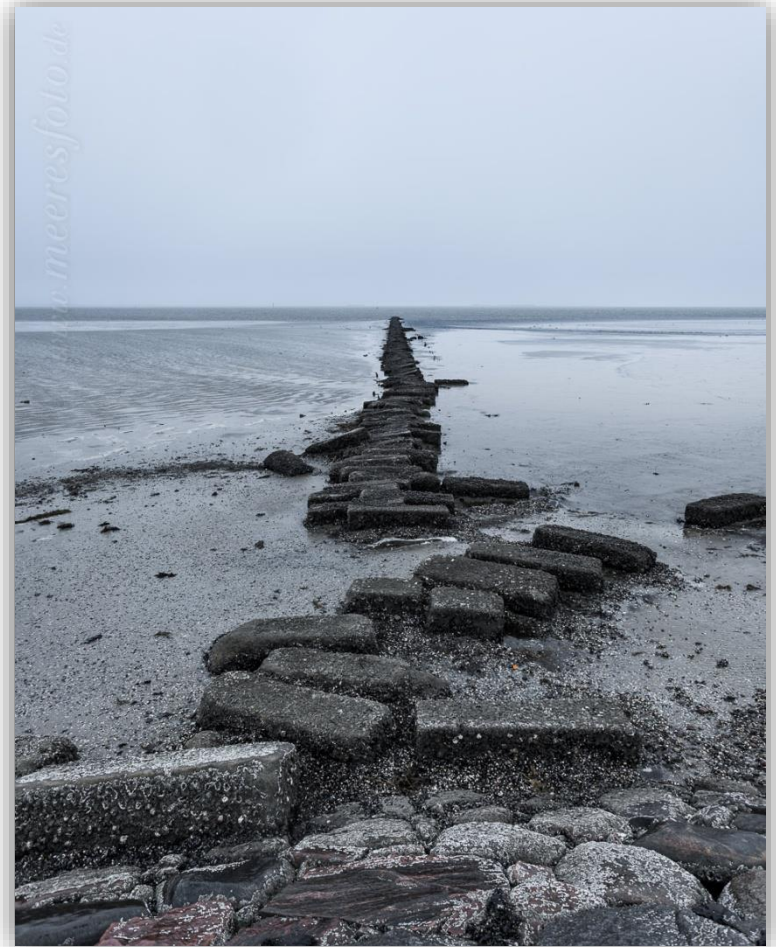
The Wadden Sea near Dagebüll (Northern Frisia)