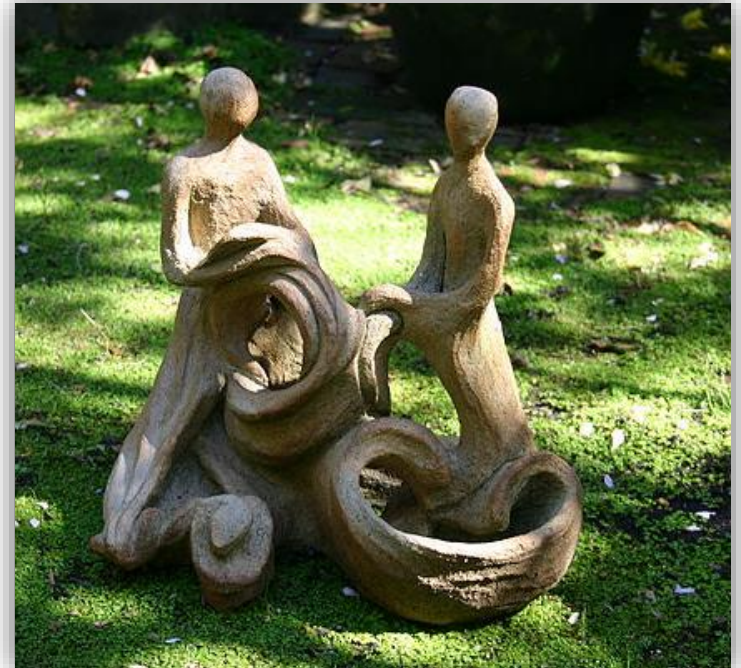
Dwelling (unknown artist, Field House Garden Chiswick Mall, London)