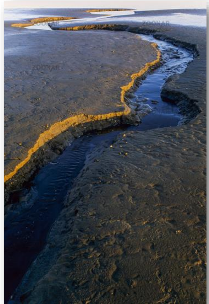
Tideway in the Wadden Sea near Meldorf