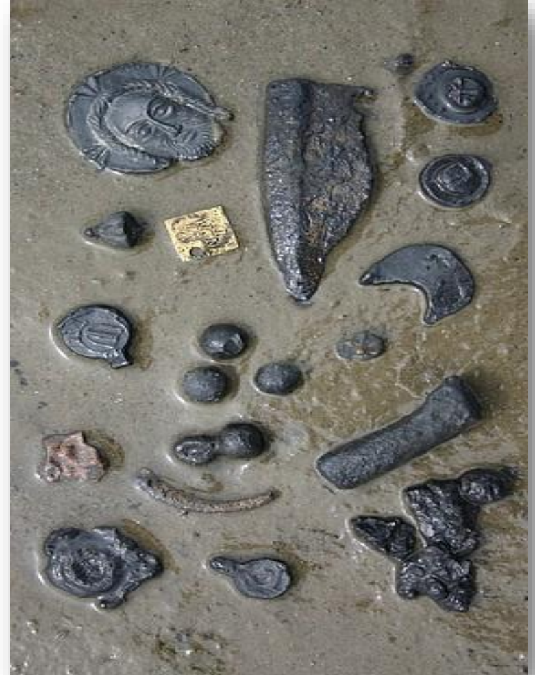
Small findings from a submerged settlement (North Frisian Wadden Sea)