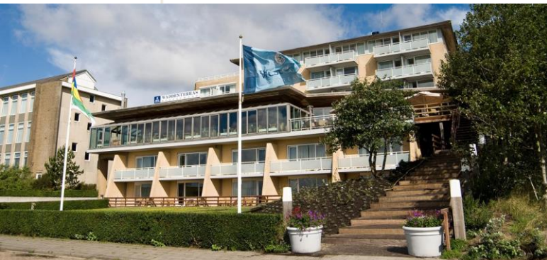
Westcord hotel Skylge