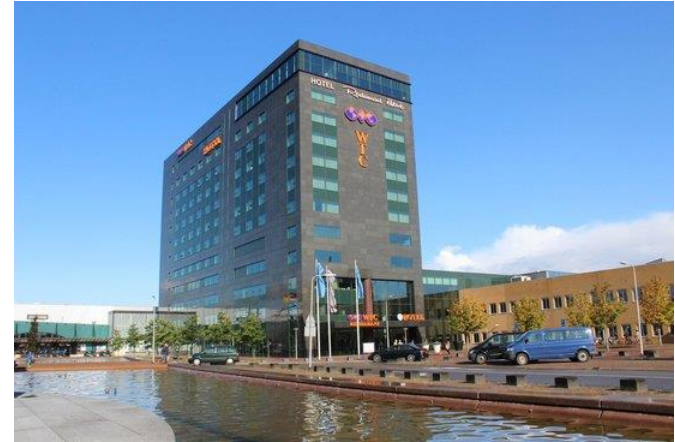
WTC Expo hotel