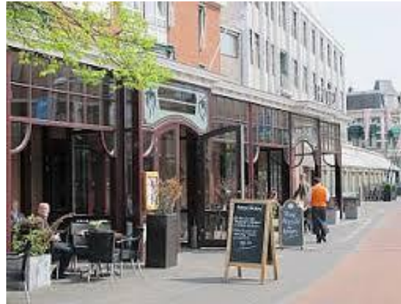
Eden Oranje Hotel