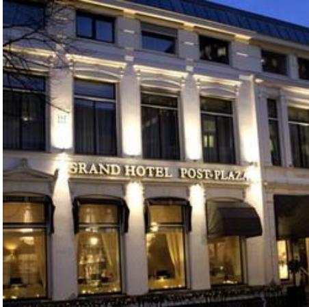
Grand hotel Post Plaza

Costs: from € 55,-- to € 150,-- for one night.